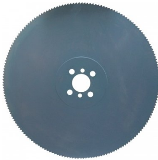
S159E HSS Cold Saw Blade