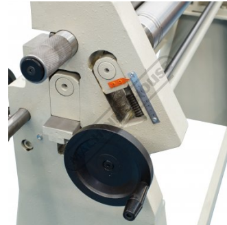
Rear Curving Roll Height Adjustment