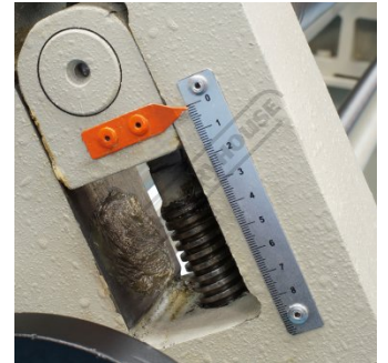
Rear Roll Adjustment Scale