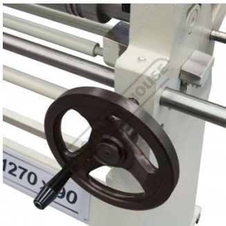
Material Thickness Adjustment