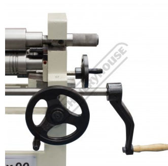
Roll Adjustment Handles