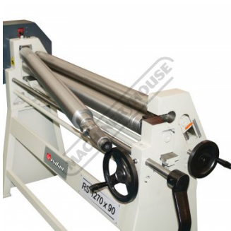
Swivel Top Roller