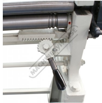
Quick Action Material Thickness Adjustment