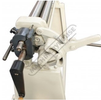
Quick Action Adjustment for Curving Rolls