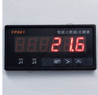
Digital Curving Roll Height Adjustment