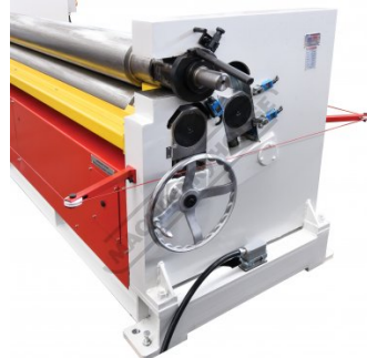
Right End View