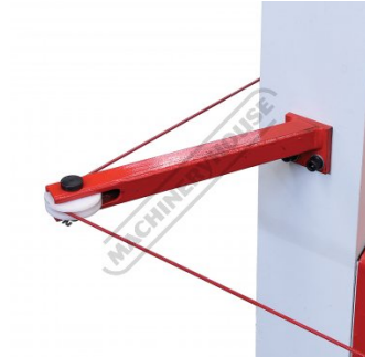
Safety Wire Interlock System