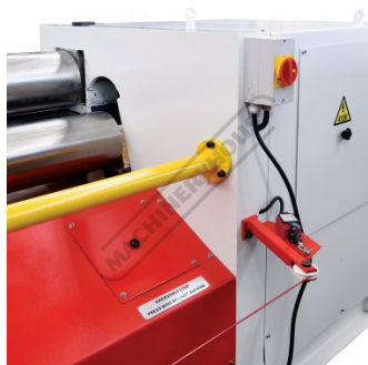
Head Rear View