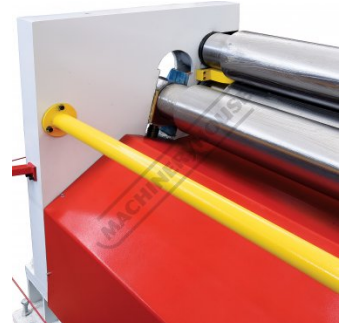
Initial Pinch Roller Design