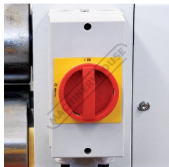
Main Power Isolation Switch