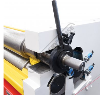
Swing Out Top Roller