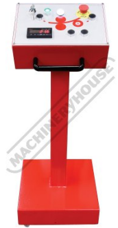
Roving Pendant Control