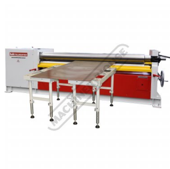
Shown with Optional Ball Transfer Tables Order Code L840