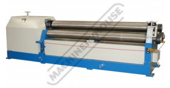
Rear View New