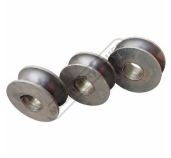
Includes 50mm Pipe Dies