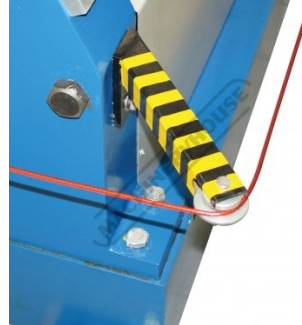
Safety Wire Interlock System