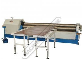
Shown with Optional Ball Transfer Tables