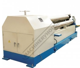
Left Rear View