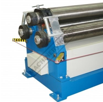
Section Roll End with Flat Bar Dies