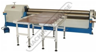
Shown with Optional Ball Transfer Tables