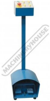
Roving Foot Pedal