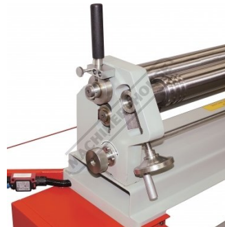
Rear View of Curving Roll Adjustment