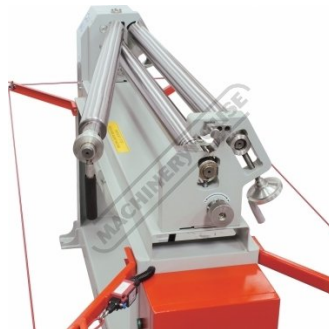
Swing Out Top Roller