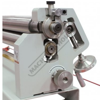
Material Thickness and Curving Roller Adjustment