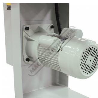
Main Drive Motor