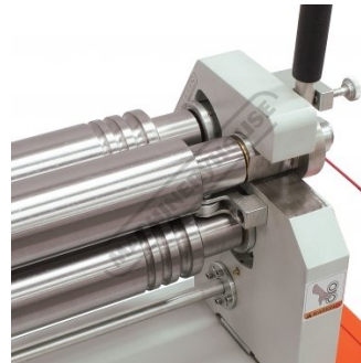
Wire Groove Rolls