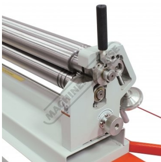
Right View of Rolls