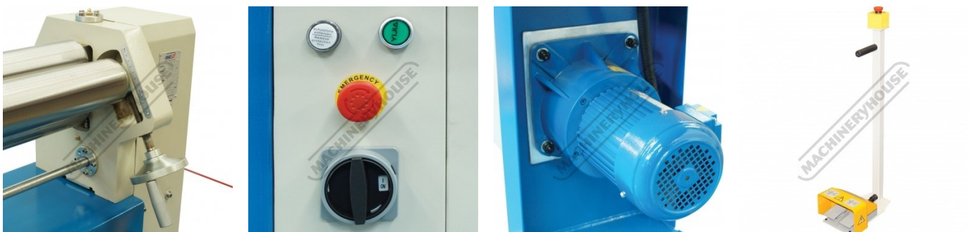
Curving Roller Height Adjustment Right Side