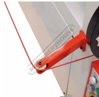
Safety Wire Interlock System