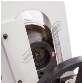
Curving Roller Height Adjustment