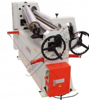
Swing Out Top Roller