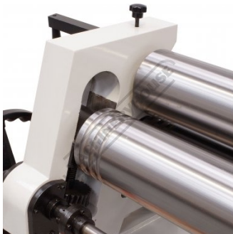
Wire Groove Rolls