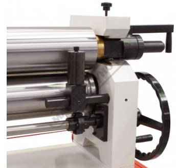
Conical Bending Guide Roller