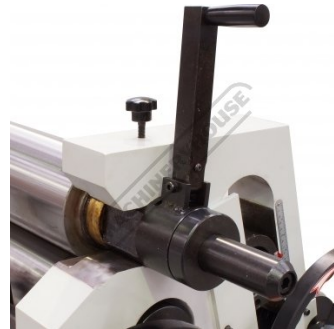
Swing Out Top Roller Handle