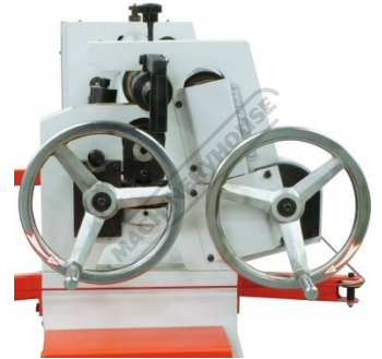
Roll Adjustment Handles