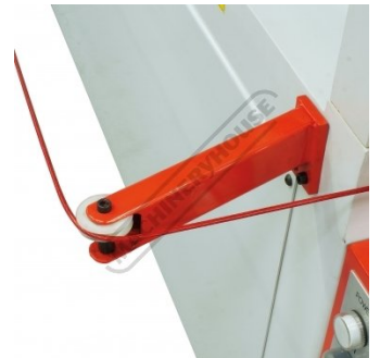
Safety Wire Interlock System