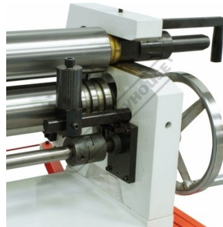
Conical Bending Guide Roller