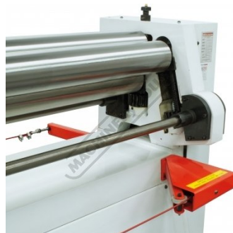
Rear View Rolls Right Side