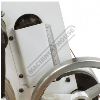
Curving Roller Height Adjustment