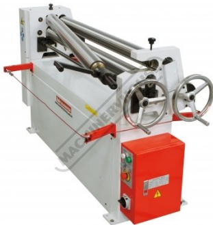
Removeable Top Roller