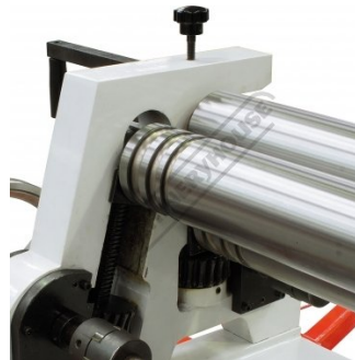
Wire Groove Rolls