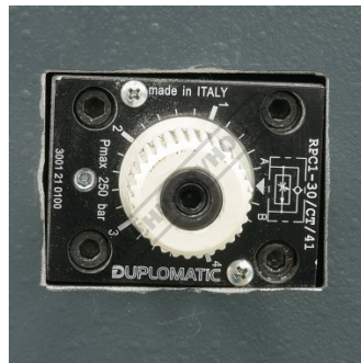
Hydraulic Pressure Adjustment Dial