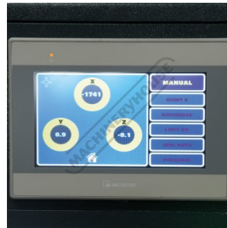
NC Control Manual Mode Screen