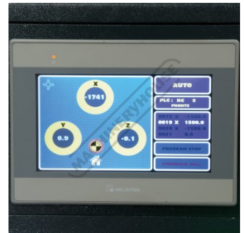
NC Control Auto Screen