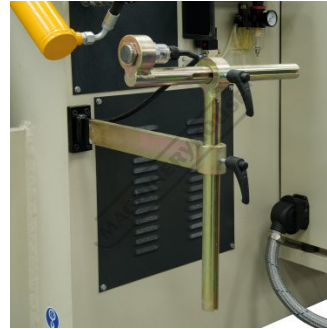
Material Length Reference Proximity Switch