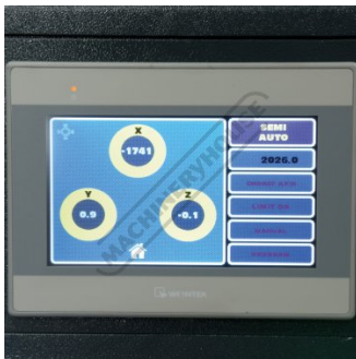
NC Control Semi Auto Screen