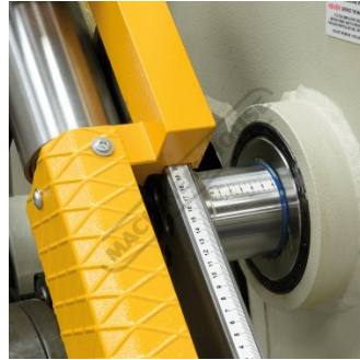
2-Axis Hydraulic Lateral Angle Guide Roller - Right Side