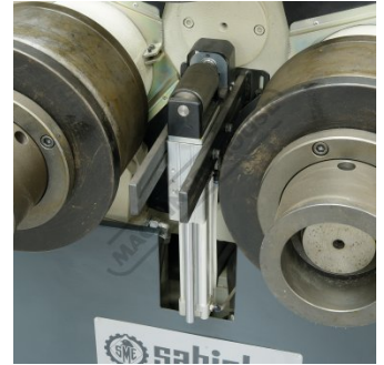
Pneumatic Positioning Material Length Encoder