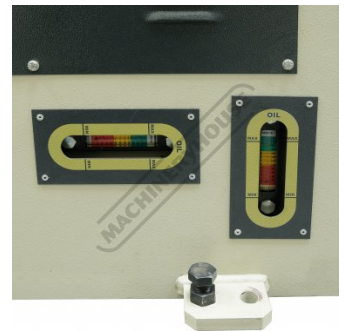
Oil Sight Glass