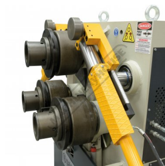
2-Axis Hydraulic Right Lateral Angle Guide Rollers