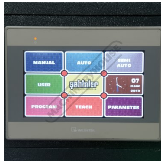
NC Control Main Screen