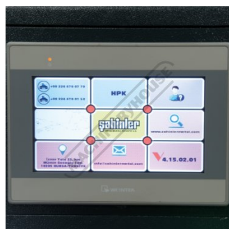
NC Control HPK Information Screen