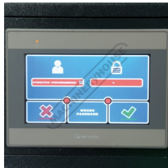
NC Control User Screen