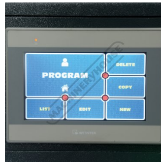
NC Control Program Screen