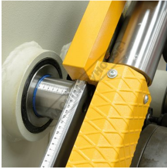
Hydraulic Lateral Angle Guide Roller - Left Side