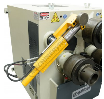
2-Axis Hydraulic Left Lateral Angle Guide Rollers