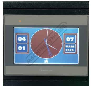
NC Control Time & Date Screen