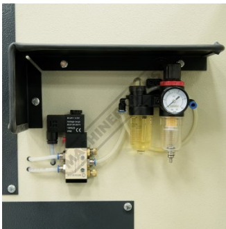
Air Pressure Regulator & Oil Lubricator