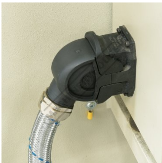
Control Panel Lead Connection