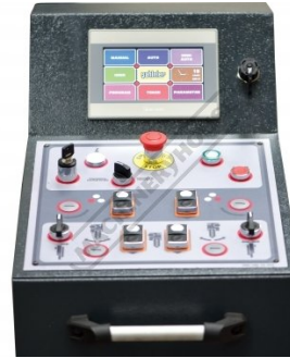
Pedestal Control Box