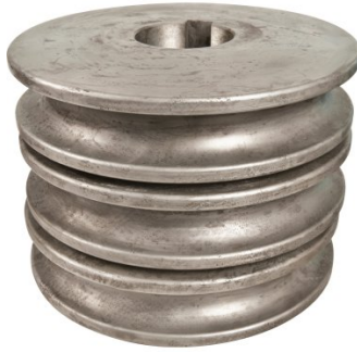
S757J 2" Pipe (NB) Roll Dies