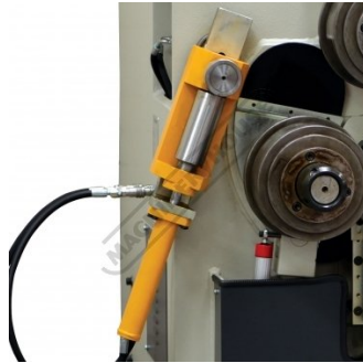
Hydraulic Guide Rollers