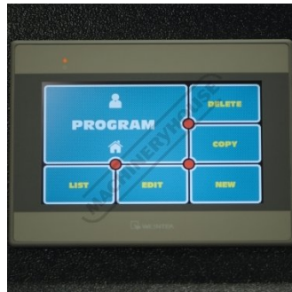
NC Program Screen