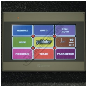
NC Touch Screen Control