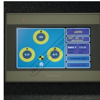
NC Auto Screen