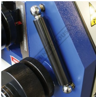
Support Guide Rolls