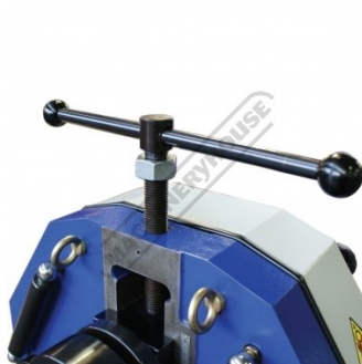
Top Roll Adjustment