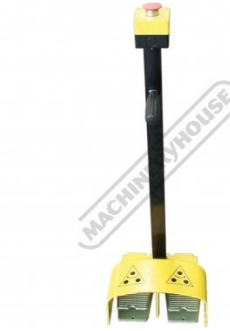
Roving Foot Control with Forward Reverse