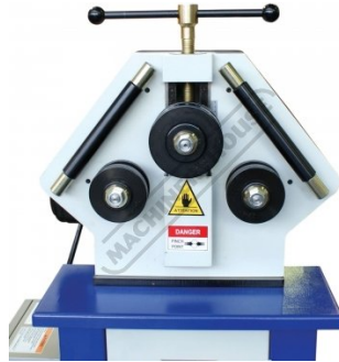
Two Bottom Rolls are Powered