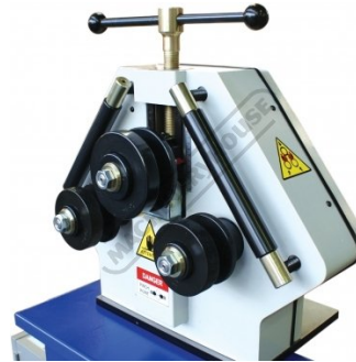
Support Guide Rolls