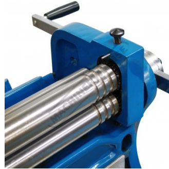
Wire Grooves Rolls