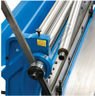
Drive Crank Handle