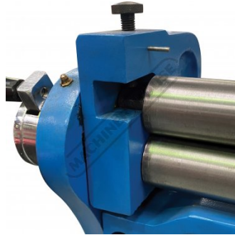
Solid End Housing & Top Roller Lock