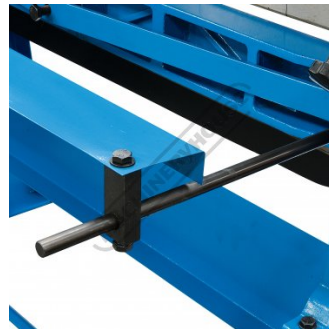
Adjustable Rear Stop