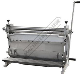
Curving Rolls Full View