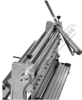
Swing Out Top Roller