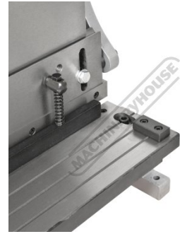
Metal Shearing Clamp