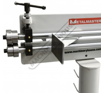
Right Side View Mounted On Machine