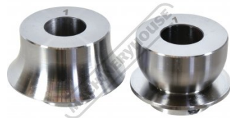
1" Die Set