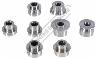
Set Rear Side