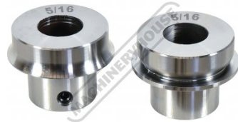
5/16" Die Set