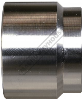
Lower Forming Die Side View (J)