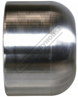
Round Tipping Die Side View (I)