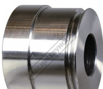
Lower Edge Forming Die (F)