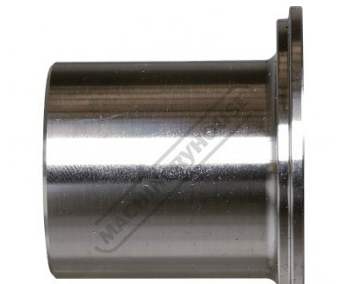
Inside Tipping Die Side View (C)