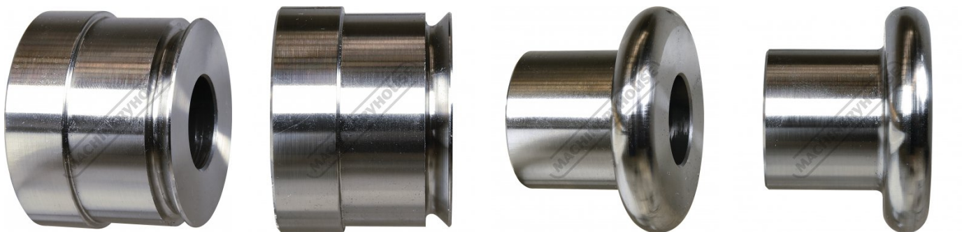
Lower Edge Forming Die (F)