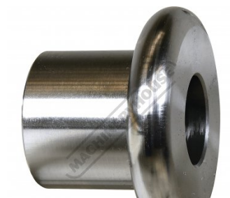
3/8 Inch Tipping Die (G)