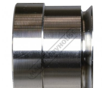
Lower Edge Forming Die Side View (F)