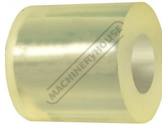
Polyurethane Lower Wheel (A)