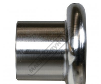
3/8 Inch Tipping Die Side View (G)