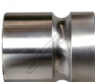
180 Degree Lower Die Side View (B)