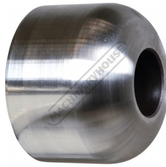
Round Tipping Die (I)