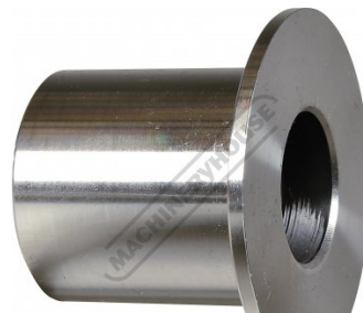
Knife Edge Tipping Die (E)