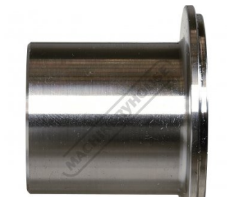
Outside Offset Die Side View (D)