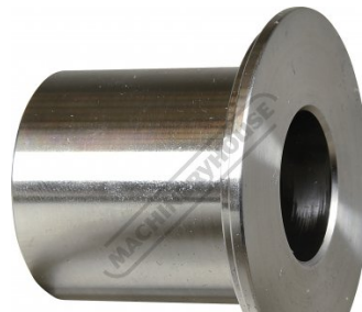
Inside Tipping Die (C)