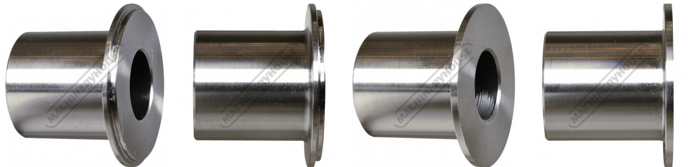
Outside Offset Die (D)