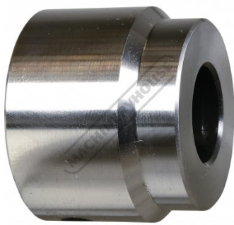
Lower Forming Die (J)