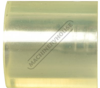
Polyurethane Lower Wheel Side View (A)