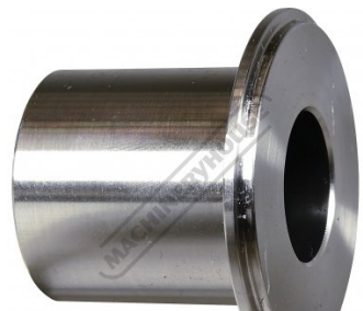
Outside Offset Die (D)