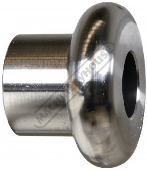
1/2 Inch Tipping Die (H)