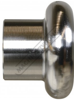
1/2 Inch Tipping Die Side View (H)