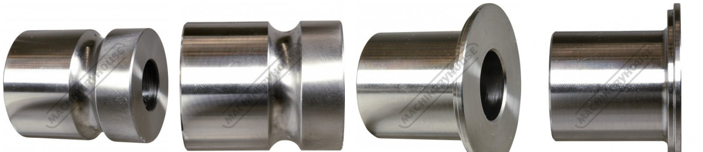
180 Degree Lower Die (B)