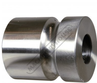
180 Degree Lower Die (B)