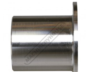
Knife Edge Tipping Die Side View (E)