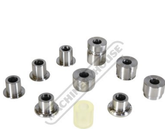
Set Rear View