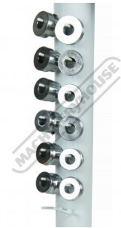
Rolls Stored on Stand