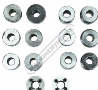
Roll Sets Top View