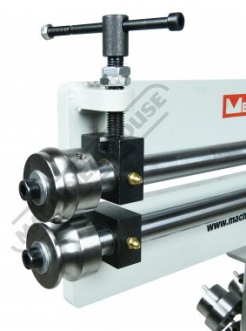
Shown With 1/2" (12.7mm) Beading Rolls