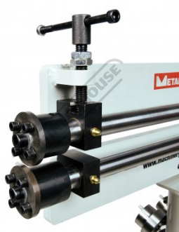
Shown with Shearing Dies