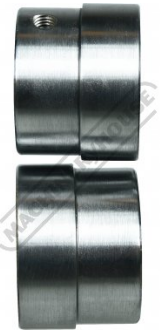
1/16 Inch (1.6mm) Flange Rolls