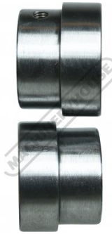
1/8 Inch (3mm) Flange Rolls