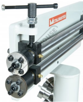
Top Roll Pressure Adjustment Handle