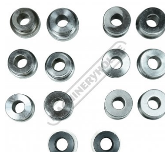
Rolls Sets Rear View