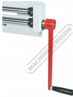
Manual Crank Handle