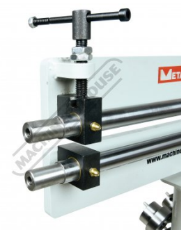
22mm Spigot for Mounting Rollers