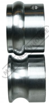
1/2 Inch (12.7mm) Beading Rolls