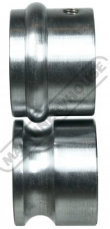
3/8 Inch (9.5mm) Beading Rolls