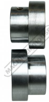
1/4 Inch (6.35mm) Flange Rolls