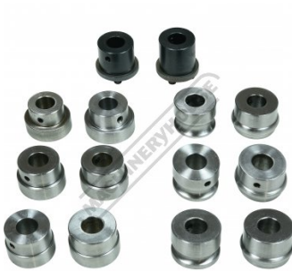
Includes 7 Sets of Rolls