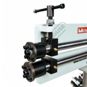
Shown with Shearing Dies