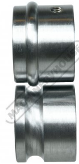
1/4 Inch (6.35mm) Beading Rolls