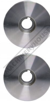
Narrow Blank Roller Front View