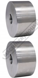
Wide Blank Roller Set Rear View