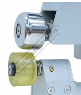
Polyurethane Lower Wheel with Round Tipping Die