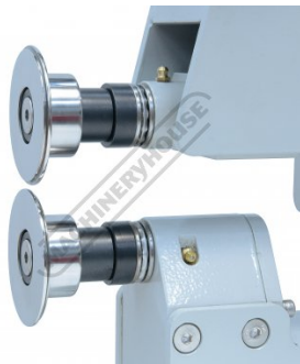
Inside Offset Die with Outside Offset Die