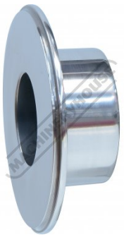
Outside Offset Die