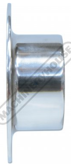
Knife Edge Tipping Die Side View