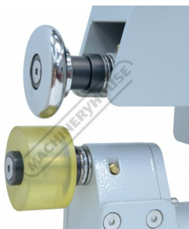
Polyurethane Lower Wheel with 1 2 Inch Tipping Die