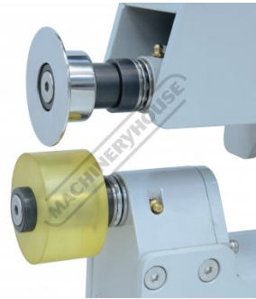
Polyurethane Lower Wheel with Knife Edge Tipping Die