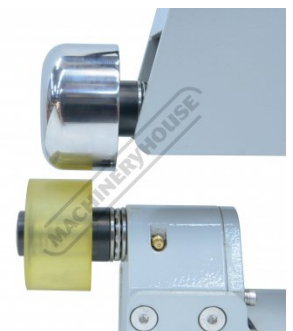
Polyurethane Lower Wheel with Round Tipping Die Side View