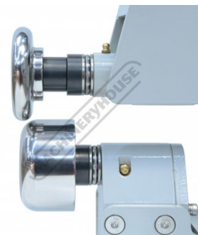
Round Tipping Die with 1 2 Inch Tipping Die Side View