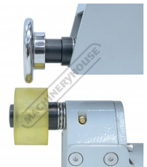
Polyurethane Lower Wheel with 3 8 Inch Tipping Die Side View