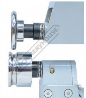
180 Degree Lower Die with 3 8 Inch Tipping Die Side View