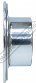
Inside Offset Die Side View