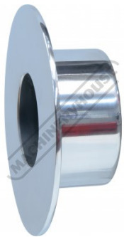
Knife Edge Tipping Die