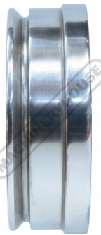
Lower Edge Forming Die Side View