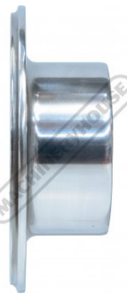
Outside Offset Die Side View