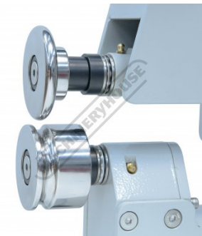
180 Degree Lower Die with 3 8 Inch Tipping Die