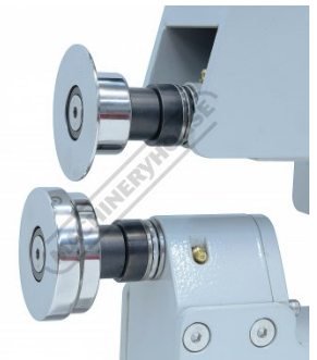
Lower Forming Die with Knife Edg Tipping Die