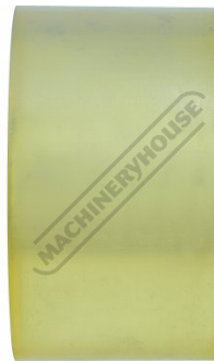
Polyurethane Lower Wheel Side View