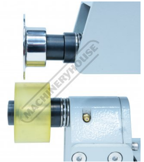
Polyurethane Lower Wheel with Knife Edge Tipping Die Side View