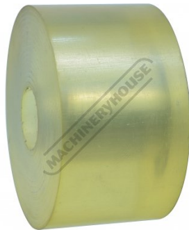
Polyurethane Lower Wheel