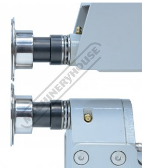
Inside Offset Die with Outside Offset Die Side View