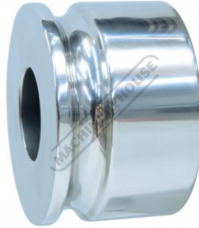
180 Degree Lower Die