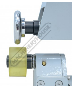
Polyurethane Lower Wheel with 1 2 Inch Tipping Die Side View