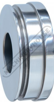
Lower Edge Forming Die