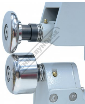
Round Tipping Die with 1 2 Inch Tipping Die