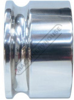
180 Degree Lower Die Side View