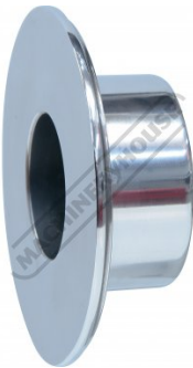
Inside Offset Die