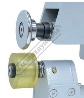
Polyurethane Lower Wheel with 3 8 Inch Tipping Die