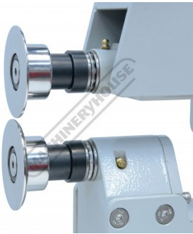
Inside Offset Die with Knife Edge Tipping Die