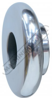
1/2 Inch Tipping Die