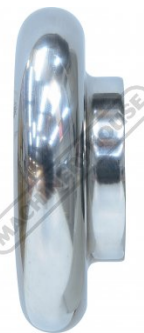
1/2 Inch Tipping Die Side View