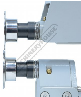
Inside Offset Die with Knife Edge Tipping Die Side View