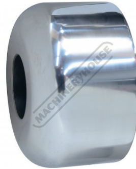
Round Tipping Die