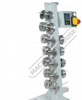
Die Rack Holders Left View