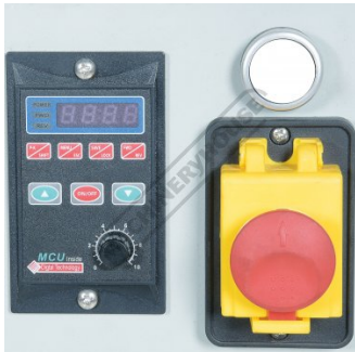
Speed Control and On Off Safety Switch