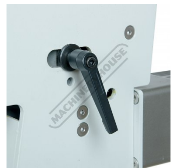
Locking Levers For Top Shaft Die Alignment