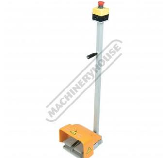
Forward & Reverse Foot Control With Emergency Stop Switch