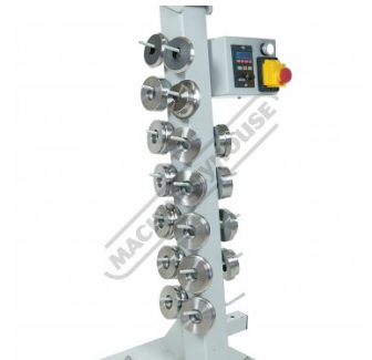
Die Rack Holders Left View