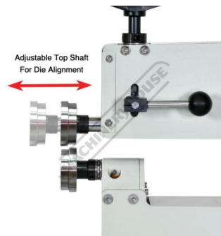
Adjustable Top Roller