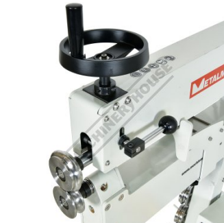
Upper Mandrel Adjustment Handle