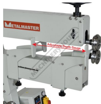
Adjustable Depth Gauge