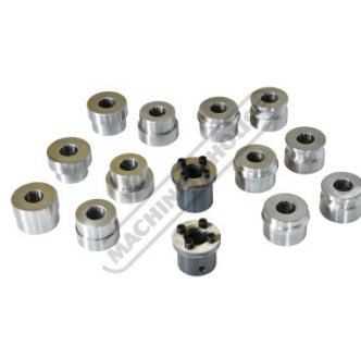
Die Set Included