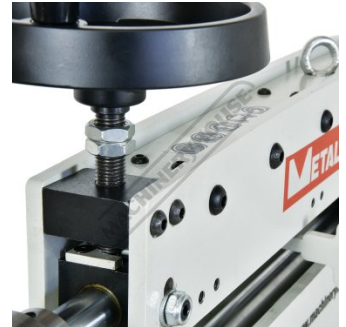
Dual Wall Frame