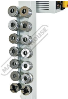
Die Rack Holder