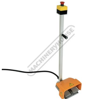
Foot Control With Emergency Stop