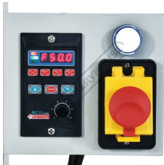
Speed Control On Off Safety Switch