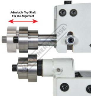
Adjustable Top Shaft