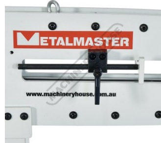
Adjustable Material Depth Stop