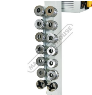
Die Rack Holder