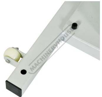
2 x Rear Wheels For Mobility