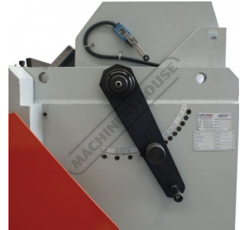
Rapid Blade Adjustment For Material Thickness