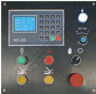
NC-89 Control Panel