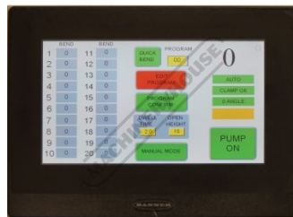
NC Ezytouch Main Page