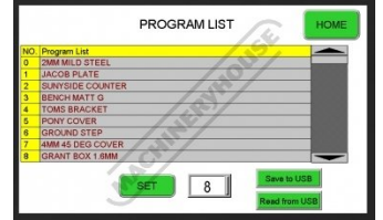
NC Ezytouch Program List