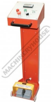
Roving Foot Controls