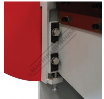
Adjustable Bending Beam