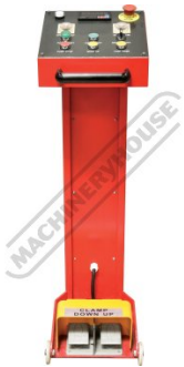
Roving Foot Pedal