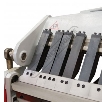
Extended Removable Fingers