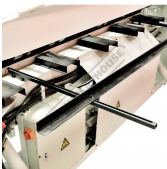
Adjustable Back Stop