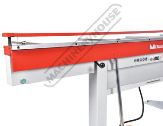
Material Clamp Up