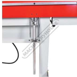
Bend Angle Guide