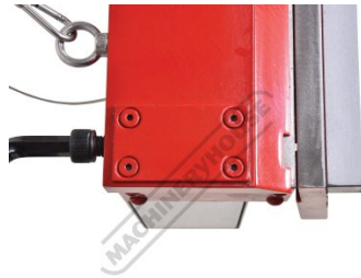
Material Thickness Clamp Adjustment 2