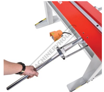
Bend Angle Guide Stop