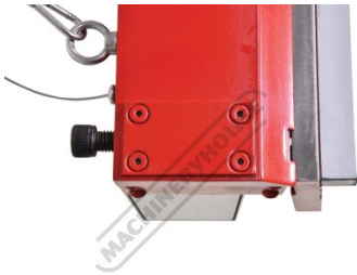
Material Thickness Clamp Adjustment 1