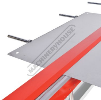
Material Length Stop