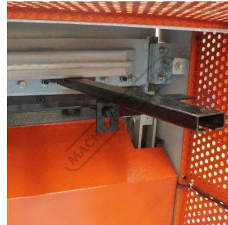
Rear Back Gauge