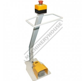
Roving Foot Pedal with Emergency Stop