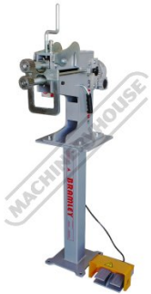
Shown On Optional Stand (B047)