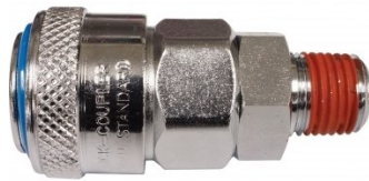
F941 High-Flow One Touch System Air Fittings