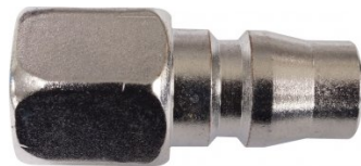
F950 High-Flow Air Fittings