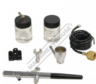
Air Brush Kit