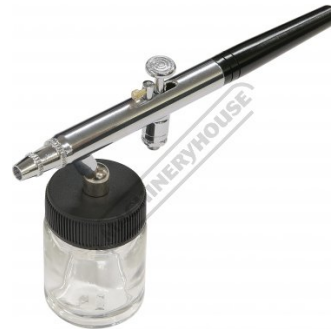
Air Brush with Paint Jar