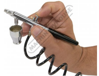
Shown In Use Paint Cup