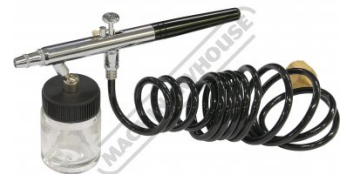
Air Brush with Hose & Paint Jar