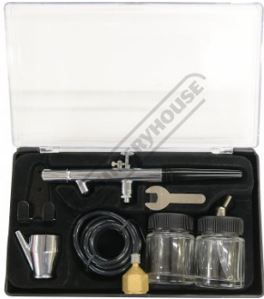
Complete Kit In Case