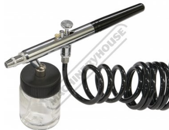
Air Brush Paint Valve Release