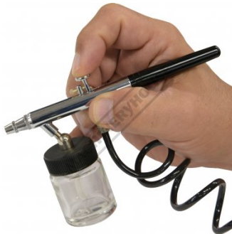
Shown Holding Air Brush