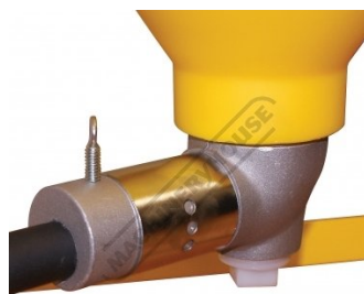
Bottom Hose Connection