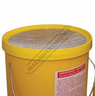
Removable Gauze Lid