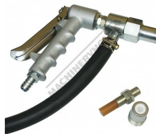
Gun and Tips