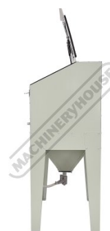
Side View Lid Open