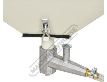
Abrasive Measuring Valve