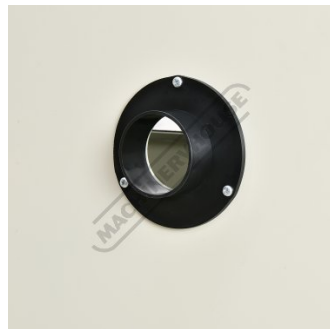
Dust Collector 63mm Outlet