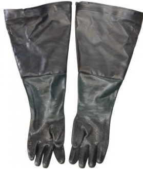
2SC0035 GLOVES PAIR