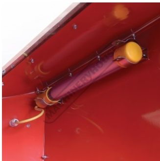
Internal Low Voltage Light