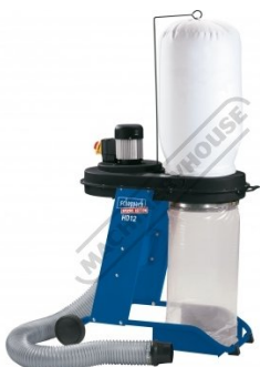
Recommended To Be Use With A Dust Collector