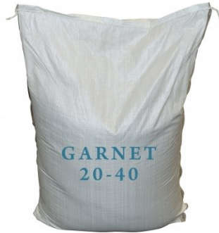
S295 Sandblasting Beads - Garnet