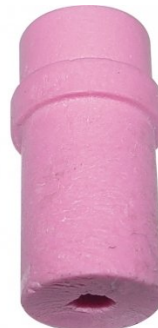
6SC0062 NOZZLES 7.0MM PKT 2