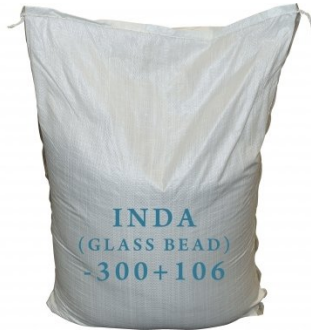
S297 Sandblasting Beads - Inda