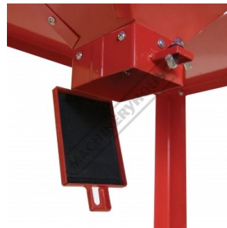
Bottom Release Trap