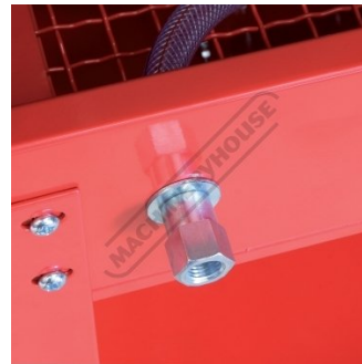
Fitting for Compressed Air Inlet