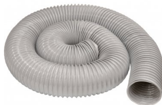
W398 PVC Dust Hose (Sold Per Metre)