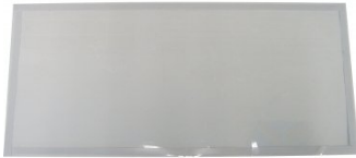
SC004 PVC SHEET PKT 5