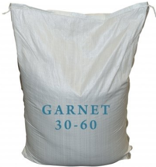
S296 Sandblasting Beads - Garnet