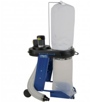
W886 Dust Collector