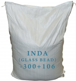
S297 Sandblasting Beads - Inda