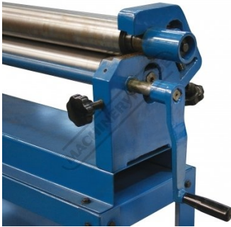
Quick Action Swivel Top Roller