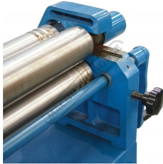
Rolls with Wire Grooves