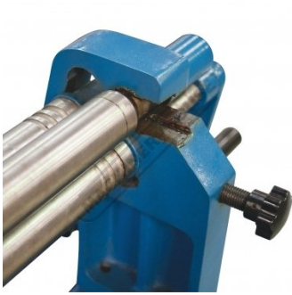
Rolls with Wire Grooves