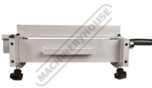
Bench or Vice Mount