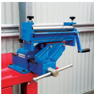
Shown Mounted in Optional Vice Left View