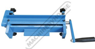
Bench or Vice Mount