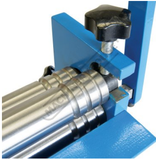
Wire Groove Rolls