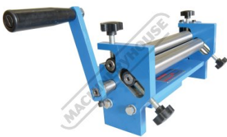
Rear Left View