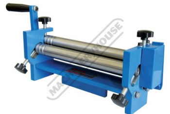
Rear Right View