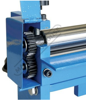
Gear Driven Rolls