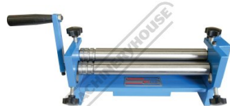
Rear Top View