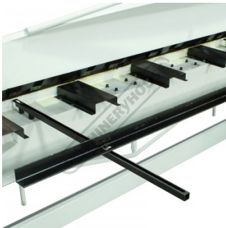
Rear Manual Backgauge