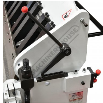
Top Beam Support Stop Lever and Thickness Adjustment Handle