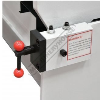
Quick Head Adjustment Handle for Material Thickness