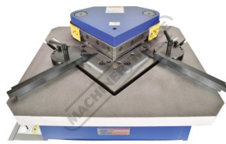
Top Close Up