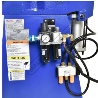
Adjustable Pressure Regulator