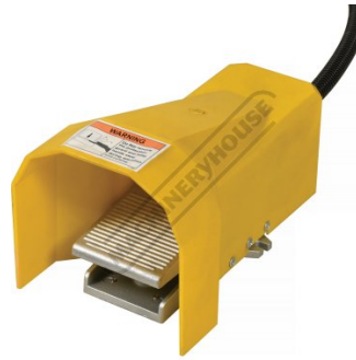
Foot Pedal Control