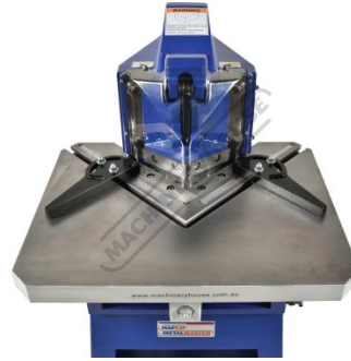
Heavy Constructed Cast Iron Working Table