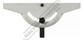
Angle Setting Gauge