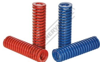
Soft, Medium & Hard Springs (Medium are Factory Fitted)