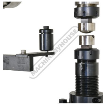
Round Roller Guide