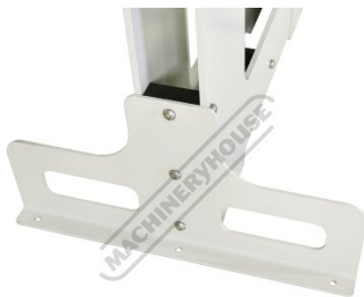
Wide Feet with Anchor Holes