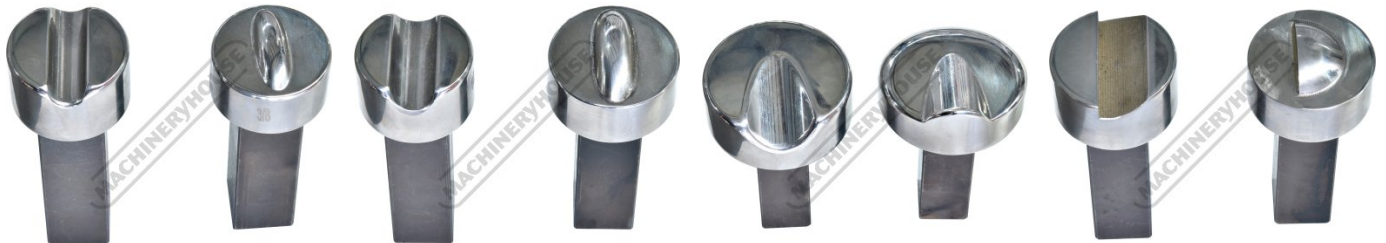
1 x Set of 3/8 Inch Beading Dies (22mm square shank) 1 x Set of 1/2 Inch Beading Dies (22mm square shank) 1 x Set of Thumbnail Shrinking Dies (22mm square shank) 1 x Set of Louvre Dies (22mm square shank)