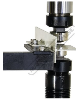
Adjustable Back Stop