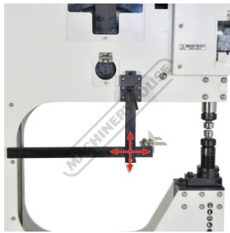
Stop Adjustable Depth Positions