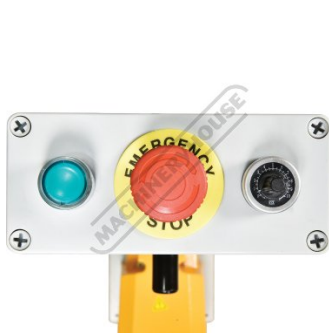
Power and Speed Control