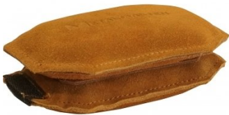
S212 Rectangle Leather Bags - Sand Filled