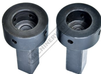
1 x Set of Round Die Holders - Ø30 x 20mm (22mm square shank)