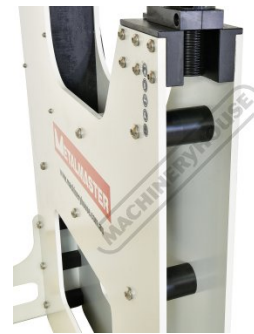
14mm Thick Steel Frame