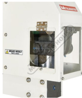
Clear Viewing Window for Adjustment Settings