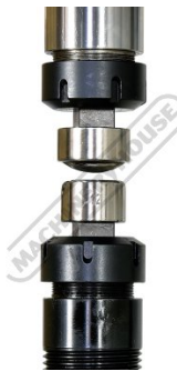
Quick Change Tooling