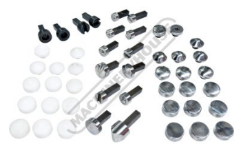
Included Dies and Holders