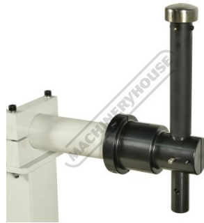
Lower Die Holder