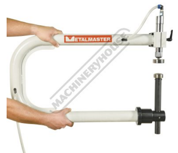
Show in Hand Held Planishing