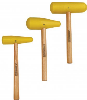
H896 Nylon Bossing Mallet Set - Tapered & Radius Ends