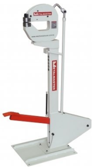
S2266 Foot Operated Shrinker Stretcher - Heavy Duty