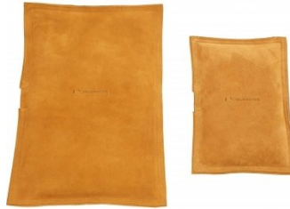
S212 Rectangle Leather Bags - Sand Filled