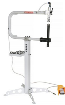
S2275 Pneumatic Planishing Hammer On Stand