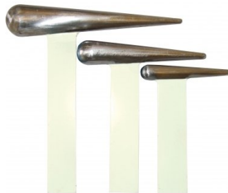
S2232 Tapered Steel T-Dolly Set - 3 Piece