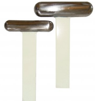
S2231 Straight Steel T-Dolly Set Large - 2 Piece