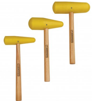
H896 Nylon Bossing Mallet Set - Tapered & Radius Ends