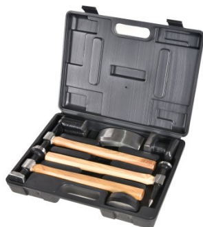
H885 Auto Panel Restoration Kit - DIY