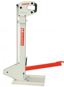
S2264 Foot Operated Shrinker Stretcher - Oval Jaws