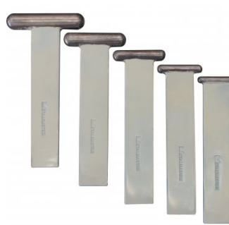
S223 Straight Steel T-Dolly Set Small - 5 Piece