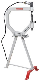
S227A Pneumatic Planishing Hammer