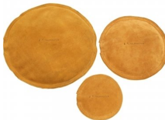
S210 Round Leather Bags - Sand Filled