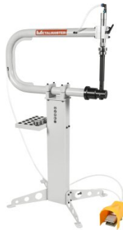
S2277 Pneumatic Planishing Hammer On Stand