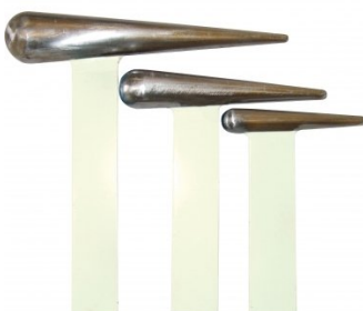
S2232 Tapered Steel T-Dolly Set - 3 Piece