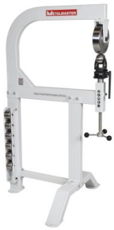
S225 English Wheel