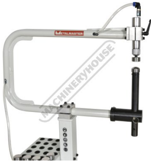
Large throat capacity 610mm deep and 362mm height