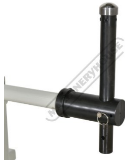
Lower die holder