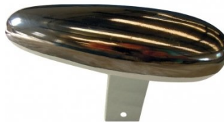
S2236 Oval Steel Dolly