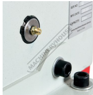
Foot Pedal Grease Nipple