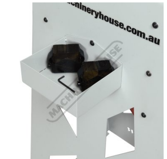
Die Holder Tool Tray