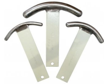
S2233 Curved Steel Dolly Set - 3 Piece