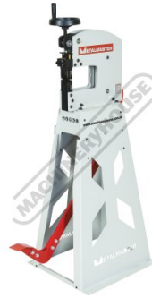
Right Angle View