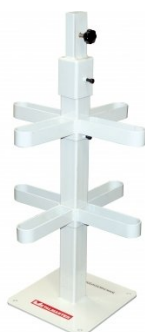
S2238 Steel Dolly Stand