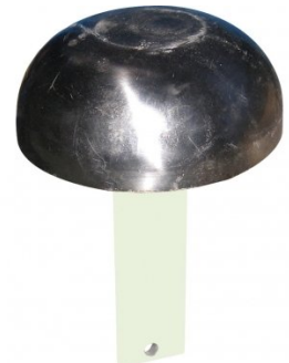
S2237 Bowl Steel Dome Dolly