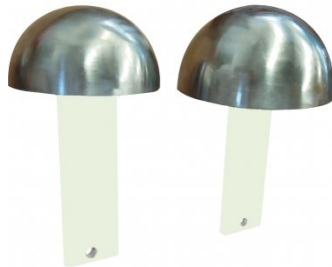
S2235 Mushroom Steel Dome Dolly Set - 2 Piece