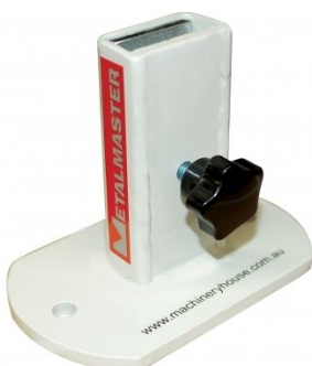
S2239 Dolly Stand Holder