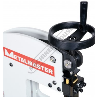
Material Thickness Adjustment Handle