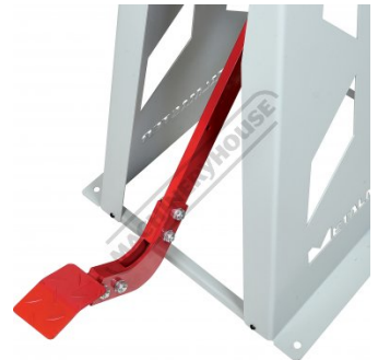
Foot Pedal Lever