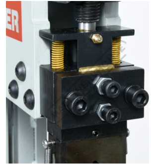
Top Die Holder