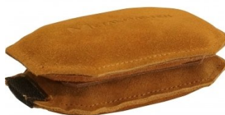
S214 Rectangle Leather Bag - Steel Shot Filled