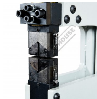
Shrinking Dies Shown On Machine