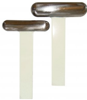
S2231 Straight Steel T-Dolly Set Large - 2 Piece