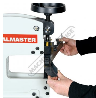
Stretching Dies In Action 2mm Mild Steel