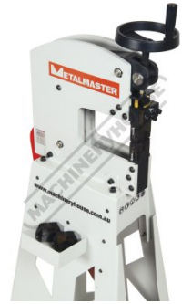
Head Top View