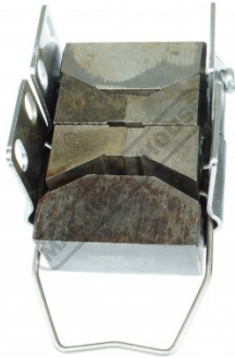
Stretcher Rear View