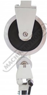
Front View Of Wheels