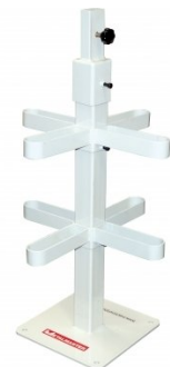
S2238 Steel Dolly Stand