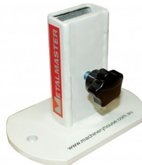
S2239 Dolly Stand Holder