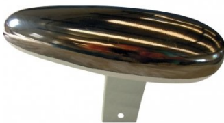
S2236 Oval Steel Dolly