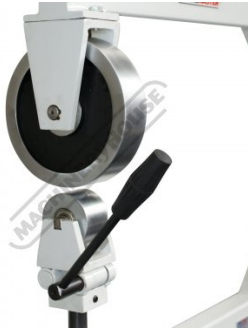
Close Up View