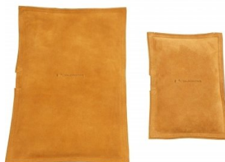
S212 Rectangle Leather Bags - Sand Filled