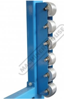
Lower Anvil Rolls